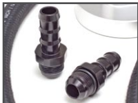
Billet Kits Include -12 AN Fittings