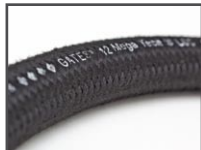
New billet kits include quality Gates Oil Lines

Now, the same high quality filtration components you've trusted for nearly a decade are available as complete relocation kits. Check out the charts on the following pages for a selection of single filter, dual filter and multi-position oil filter relocation kits. Each kit includes a remote filter base, application specific filter bypass adapter, aluminum fittings and braided oil lines.