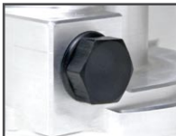
Select bases include Instrumentation Port