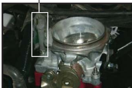
Ref. A- 6mm x 3½ Stud, 6mm Flat Washer, 6mm Nut Ref. B- Throttle Body Ref. C- 6mm x 60 (2) Bolt, 6mm Flat Washers